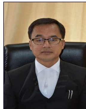
Hon'ble Mr. Justice Ahanthem Bimol Singh Judge In-charge, Judicial Education & Training Judge, High Court of Manipur